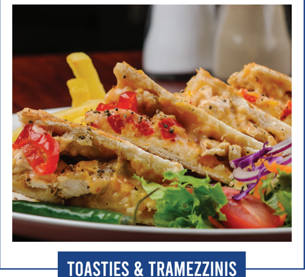
TOASTIES & TRAMEZZINIS