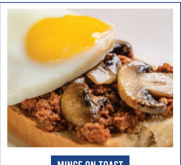
MINCE ON TOAST